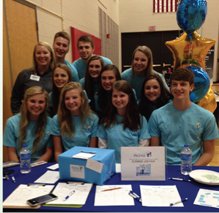
Student volunteers were gracious hosts at the La Crosse Promise Career Fair