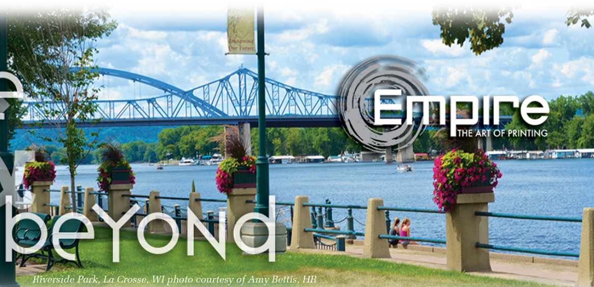
Riverside Park, La Crosse, WI