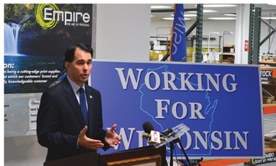
Gov. Walker promotes FoodShare Assistance and Job Training Program

April 20, 2016 WI Governor, Scott Walker made a stop at Empire Screen Printing in Onalaska, WI to promote his $60M FoodShare Program. The governor's food assistance and job training program has been in place since April 2015. Empire is one of many companies helping WI workers through this program.