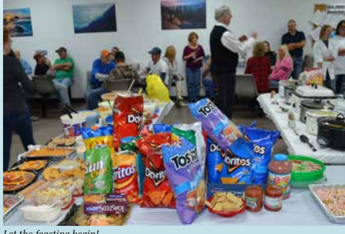
Let the feasting begin!