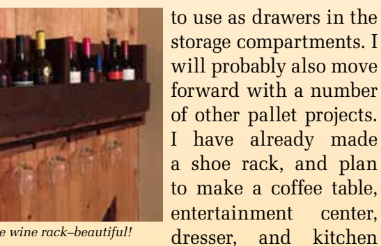
table...all, of course, out of recycled pallets! For something as simple as a pallet, there sure are a lot of awesome options and possibilities!

I am still planning to add some type of lighting that will shine from underneath and candle lanterns or shelving that will hang from either side of the headboard. I also want to add handles and hinges to the sides, so that the pallets can easily fold up and be transported that way. If I find some affordable wooden milk crates, I am going to stain them the same color as the bed frame