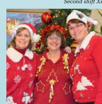
Christmas ladies in red