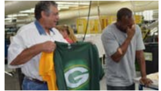
The pain & humiliation of it all...