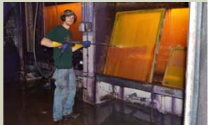
Just doing what needs to be done