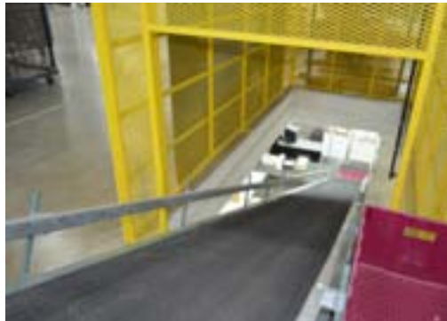
Pete's machine shop built the shipping conveyor