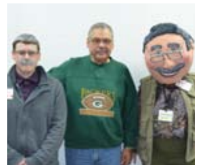
Imitation is the sincerest form of flattery... or at least we hope that it is!