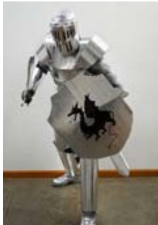
2nd Place - Kevin Schmitz (LVS) "Knight in Shining Armor"