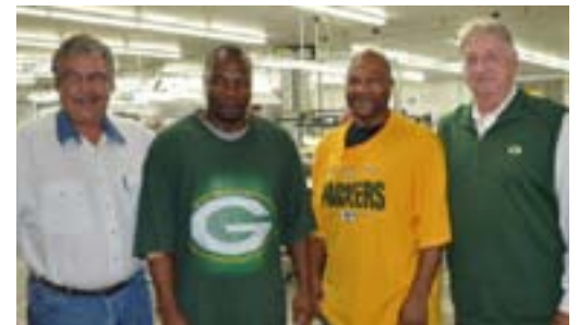
The Kendricks look good in green and gold!