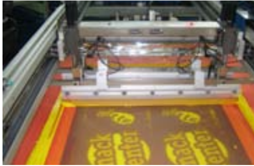
25x38 were modified with water cooling tables