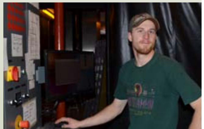
Empire thinks Chase is in hte right 'seat'