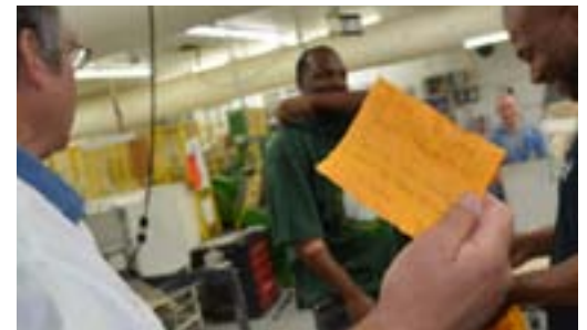
Could this be a note of regret??