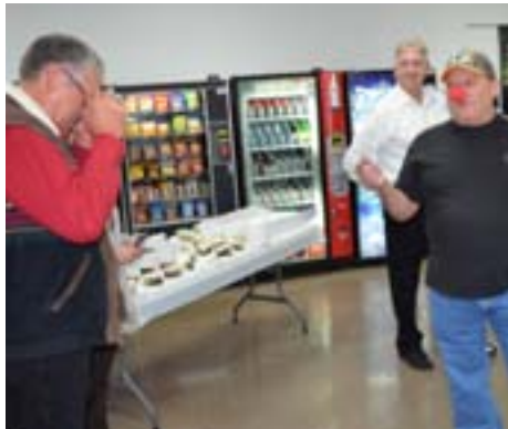
Pete always seems to get the last laugh.