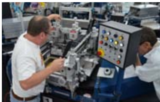
3-Color UV LED Empire Express 12x14