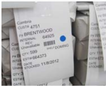
New barcode label w/ Int. #

Our kaizen started off by going over the overstock system that was already in place. The system worked well, but it still needed some improvements to eliminate human error, improve efficiency of inputting overstock and create a more accurate inventory of the overstock itself.