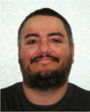
Empire HVAC Specialist Dec. 2005 to present