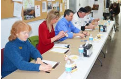
These judges take their job seriously