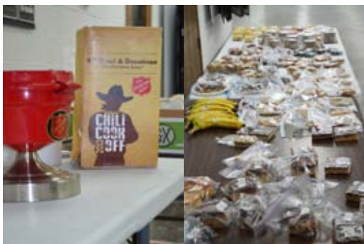
Ready to kick off the Bake Sale & Chili Cook-Off

"THANK YOU, to all who made chili, sent baked items and helped with setup/ clean up. Everyone had fun and we will be looking forward to next year's event to be even better!"