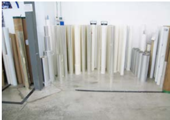
Developing a solution on how to handle large material rolls.

The wash up station is clean, free of obstacles, PPE signage posted, PPE is easily accessible, and spill hazards have been removed. The only item left to complete is addressing the material rolls as a injury hazard due to tipping, crushing or lifting. Tom is working with the machine shop to develop a safe delivery and storage system for the material rolls.