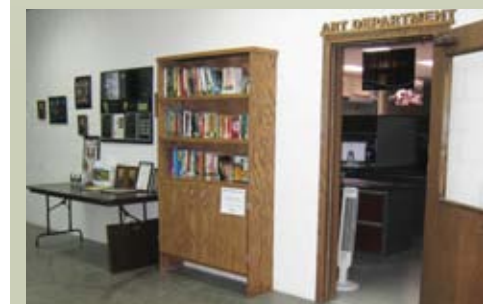
Books are accessible to all employees on any shift.

Empire's Employee Lending Library is now open. The bookshelf is located outside the Art Dept., by the Empire awards table.