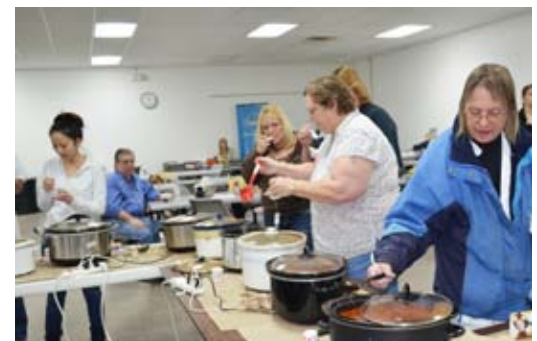
Decisions, decisions...which do we try first?