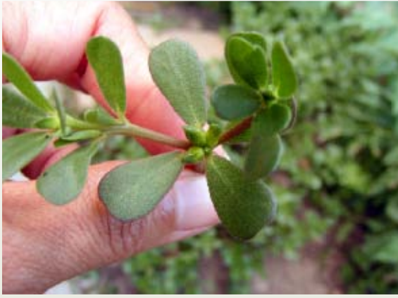
Commonly found wild purslane

Myself having been raised on a farm in Vernon County, Wisconsin, we had a