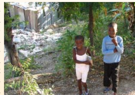
Some of the local children we met on our trip.

first church was damaged so badly that the local people were afraid to enter. So, from the ground up we started the work; pouring footings, setting block with mortar, then putting the first roof rafters in place. After this took place, the local folks broke forth in celebration. They could not express their thanks enough for us coming to help them. The second church was not as severely damaged as the first. The first order of business was to remove damaged parts of the floors and walls. We then patched and painted the entire building. As we built pews we had the opportunity to spend more time with the local people. We watched craftsmen take 55 gallon drums and old car bodies and pound them flat, as they began to shape and cut out art and