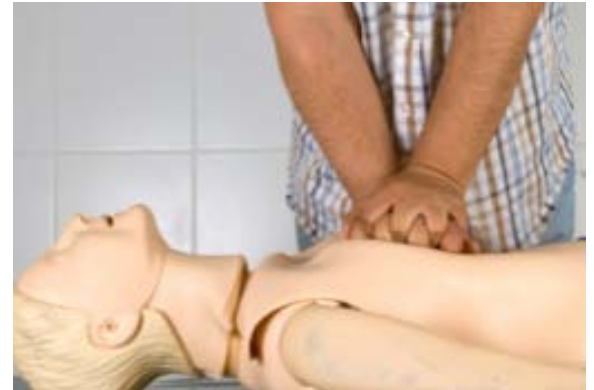
Training makes taking charge in an emergency easier.

If a CPR or first aid emergency arises there will always be trained employees on hand, ready to help. Who knows, it may be your life they save.