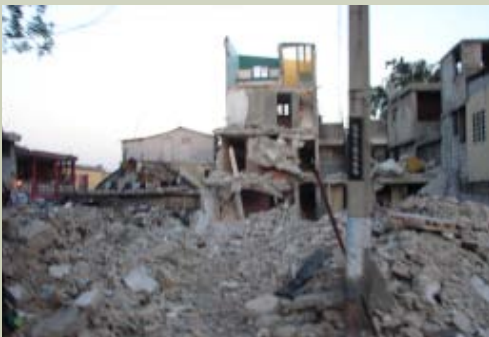
The amount of devastation was incredible

met and surrounded by men wanting to carry our bags for a tip. They even went so far as to pull your bags out of your hands and off your shoulders. This created arguments amongst