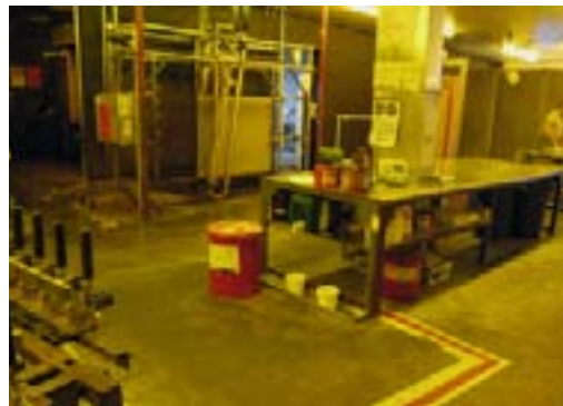
Note the updates: new floor markings, drip tray & overall cleanliness in Screen Making.

overall effort for cleanliness of the department needed to be stepped up. It was an easy fix. It was also pointed out that safe walk ways needed to be mapped out for people outside of Screen Making.