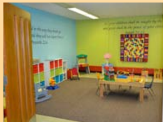
Completed Eagle Project at the Roncalli Newman Center

A scout is... trustworthy • loyal • helpful • friendly • courteous • kind • obedient • cheerful • thrifty • brave • clean • reverent