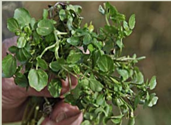
Watercress, another tasty edible plant