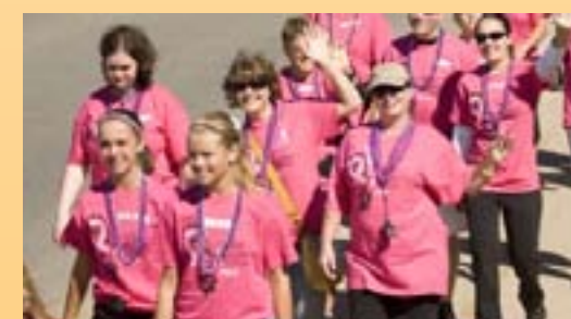
Smile and wave ladies... smile and wave