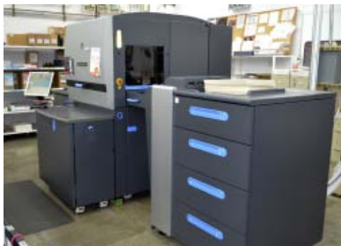
The new press can be loaded with multiple substrates, reducing change over time.

At the end of the summer, Empire replaced one of its HP 2000S presses with a new HP5600. This new press delivers improved image quality, versatility and productivity. Its updated rip will allow us to utilize our Alwan color management, and will soon prove to be a valuable asset to Empire as it is integrated into production.