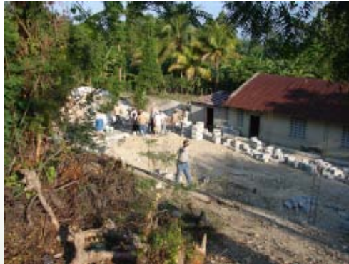
One of the churches slated for earthquake repairs

As we traveled to the campus where we would be staying, the sights