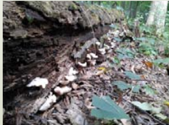
Edible Oyster Mushrooms on a decaying log

I was amazed to hear about the number of people out in the woods shrooming in the fall long before I started. I would recommend to anyone starting this hobby to do a lot of research. Make sure you go with someone that is experienced to gain knowledge. Shrooming can be a lot of fun and is very rewarding. For more info go to www.wisconsinmushroom.com for a really good look at the fungi.