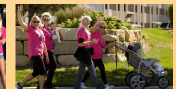
Great cause, great day to be out and about