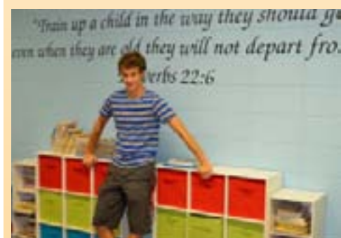
After the lessons he's learned this Eagle is ready to fly.

Eagle Scout is the highest rank attainable in Boy Scouts of America. Just over 2 million boys have reached Eagle in the past 100 years. Currently, only 4 of every 100 scouts earn Eagle, that's less than 1% of the male population. Requirements include earning at least 21 merit badges and demonstrating Scout Spirit through the Boy Scout Oath and Law, service, and leadership. This includes an extensive service project that the Scout plans, organizes, leads, and manages.